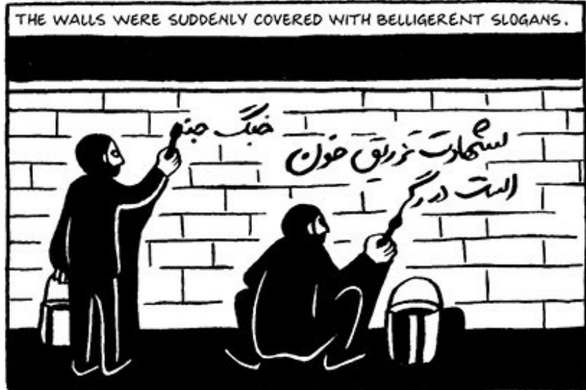
THE WALLS WERE SUDDENLY COVERED WITH BELLIGERENT SLOGANS.