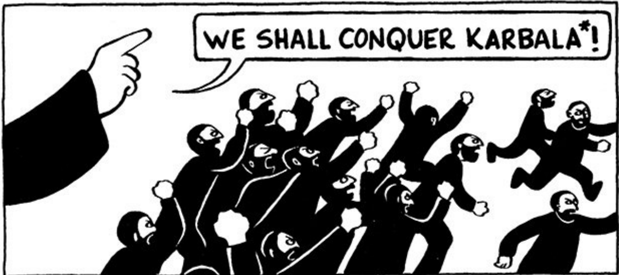
* A SHIITE HOLY CITY IN IRAQ