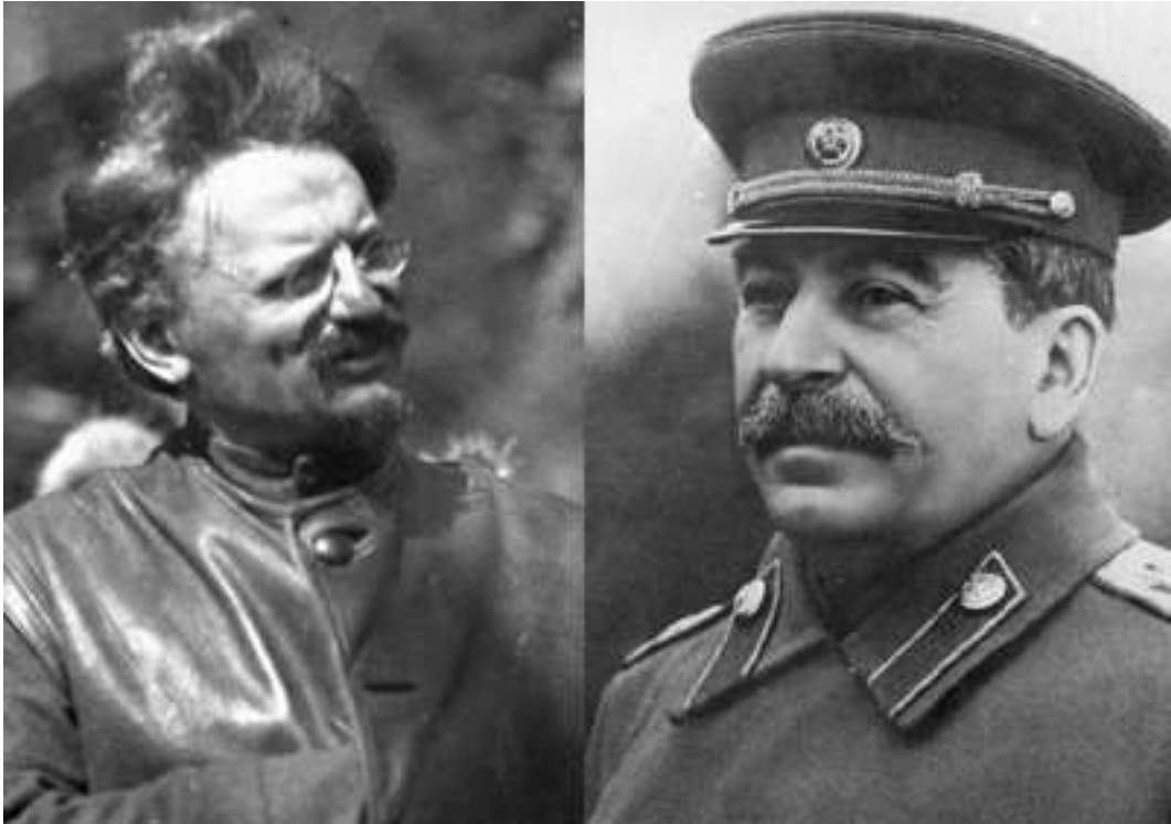
Trotsky and Stalin, the two leading Russian figures that are parodied in the novel