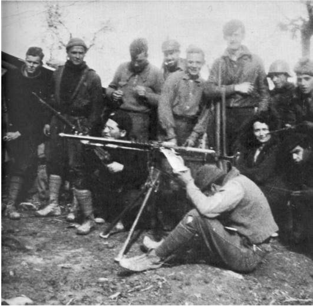
Orwell (tallest figure) during his time in the Spanish Civil War