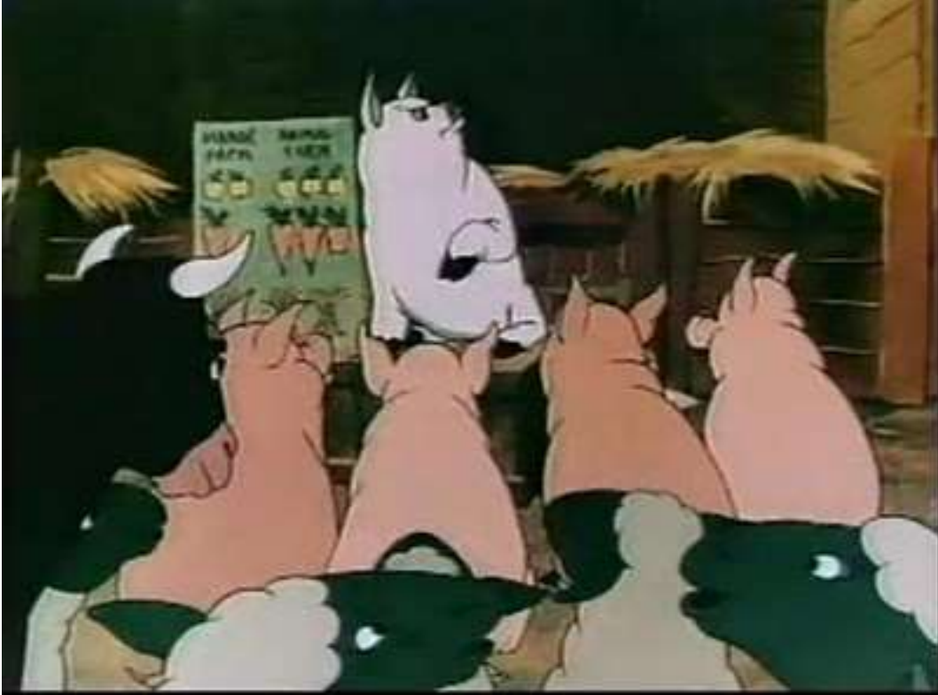
An image from the 1954 animated film where the ending of the novel was changed